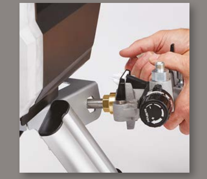
3. USE FRAME TO REMOVE CARTRIDGE