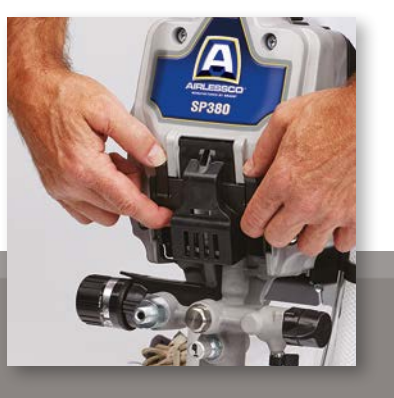
1. SLIDE OPEN THE ACCESS DOOR

Skip the downtime and extra costs of waiting for replacement parts or driving to the service center. Airlessco keeps you productive with the Quick Repair Pump system. With a spare cartridge kit on hand, you can remove and replace the cartridge in four simple steps and get back to work.