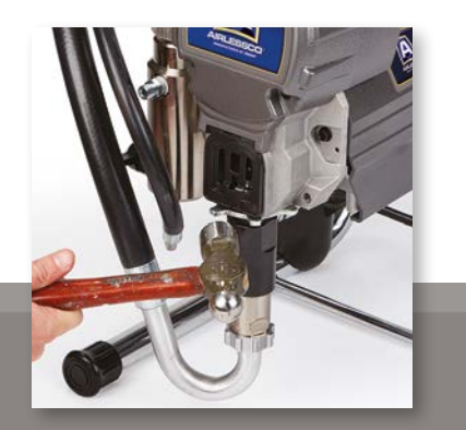
1. LOOSEN LOCKING NUT

Airlessco keeps you productive with the Quick Repair Pump system. Reduce downtime and change the pump on the job — no special tools needed!