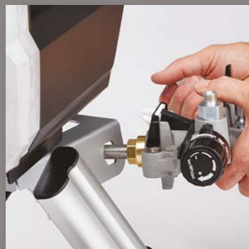
3. USE FRAME TO REMOVE CARTRIDGE