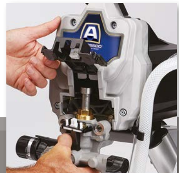
2. REMOVE PUMP SECTION