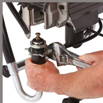
3. DISCONNECT HOSES