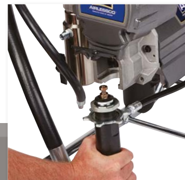
2. LIFT DOOR AND REMOVE PUMP