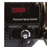
DISPLAY CONTROL FEATURE