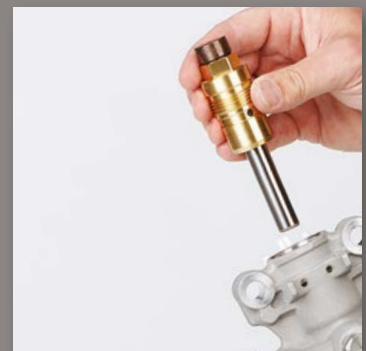
4. INSTALL NEW CARTRIDGE AND REPLACE PUMP