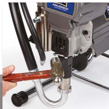
1. LOOSEN LOCKING NUT

Airlessco keeps you productive with the Quick Repair Pump system. Reduce downtime and change the pump on the job — no special tools needed!